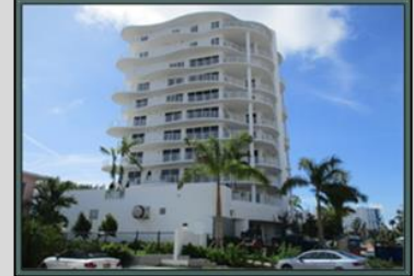
Luxury Condominium Project Ft. Lauderdale, FL