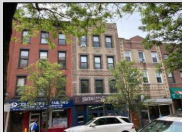
Union Street Multi Brooklyn, NY

Portfolio Acquisition Loan Value Add Multifamily