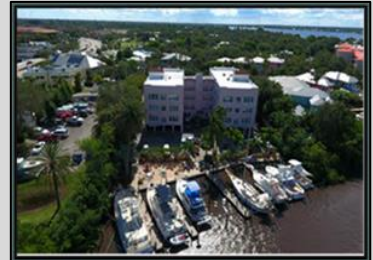
France Apartments Stuart, FL

Acquisition & Renovation Loan 58-Unit Value Add