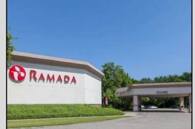
Acadian Crossing Lafayette, LA

Conversion of a 160-Key Hotel to Apartments & a 34-Unit Stabilized Apartment Asset