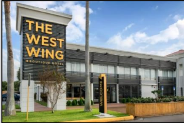
West Wing Apartments Tampa, FL