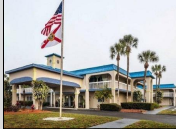
Hotel To Multifamily Conversion Tampa, FL

Conversion of a 115-Key Extended Stay Hotel to Apartments