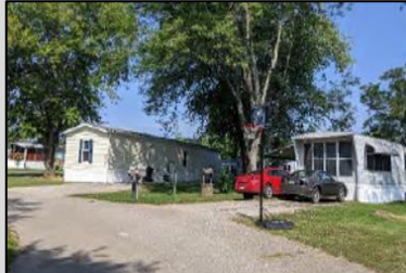
Mobile Home Communities Zanesville, OH

Acquisition and Renovation of Three MHCs